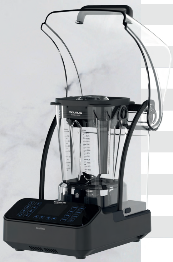
DESIGNED IN SPAIN